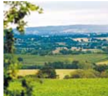
Agriculture in the UK Page 26