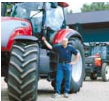
Valtra S260 to a big pig farm Page 16