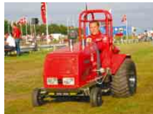
The characteristics of their "little" Valtra tractor is: 135 hp 2V2VKi engine with a 1 000 cm 3 displacement. The maximum speed is 75 km/h, and the net weight is 500 kilograms (including the driver).

The Danish Valtra Garden Pulling team for the time being works at a secret plan to build a new tractor of 180 hp for the next season, so that next years Danish Championship could go to Valtra again. Just now there are about 12 active Garden Pulling teams "modified 500 kilograms" in Denmark.