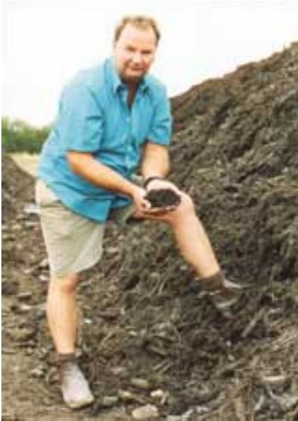
Compost from composted organic waste collected from Council civic amenity recycling sites is a useful addition to difficult Wealden soils