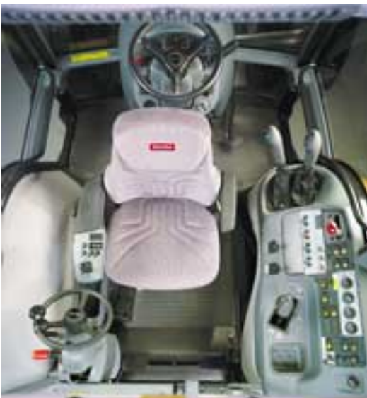
The large cab provides ample space, and allows working in different directions. All controls are ergonomically positioned.