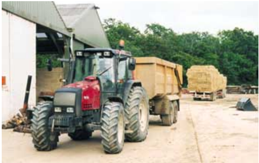
Hauling grain, straw, muck, building and demolition materials, its all in a day's work for Trevor's Valtras

Lower fuel consumption has also been noted since the purchase of the Valtra tractors.