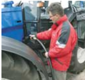
More power with lower emissions Page 22