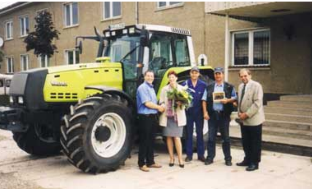
A hearty welcome greets Agrar GmbH Oldisleben's 11th Valtra tractor – and the hand-carved wooden tractor model that was included in the delivery from Finland.